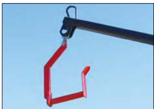
Homologated rotating truss hook